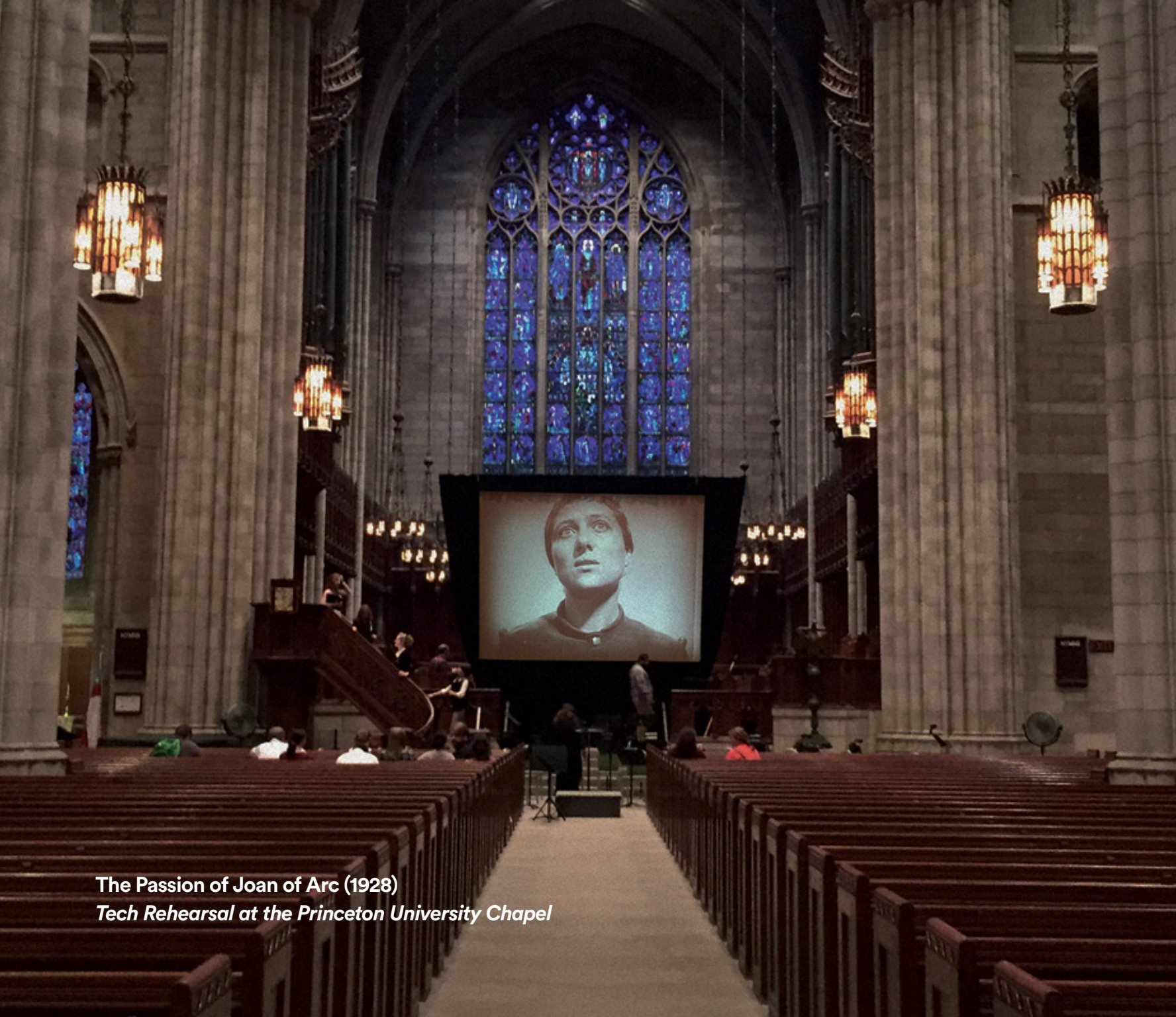
The Passion of Joan of Arc (1928) Tech Rehearsal at the Princeton University Chapel