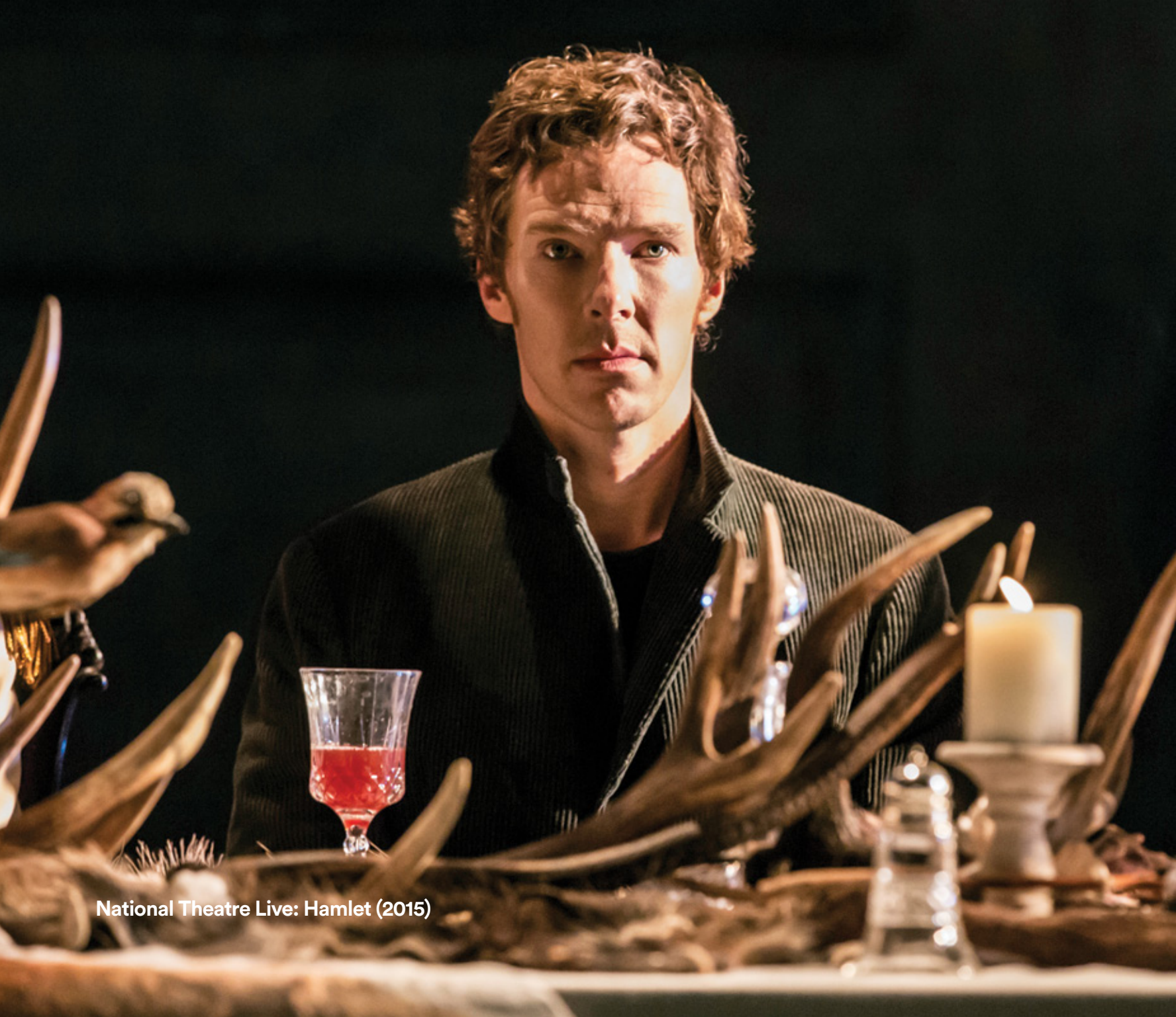
National Theatre Live: Hamlet (2015)